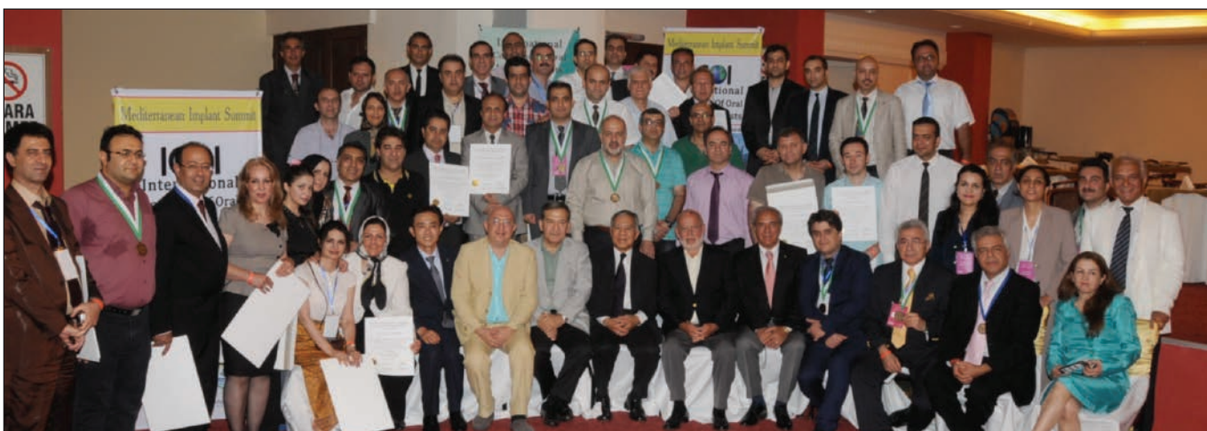
Iranian Center of Oral Implantology at the Mediterranean Implant Summit in Kusadasi, Turkey.