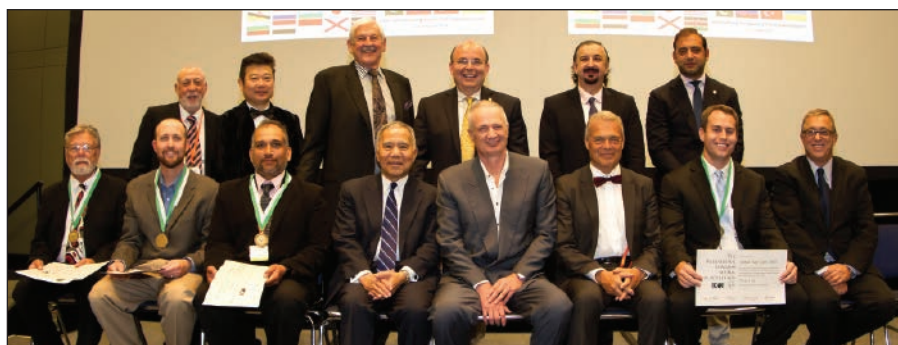
Mastership award winners.

Growing in popularity was our class of new Masters. Receiving their Masterships were the following: