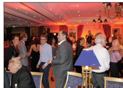
Dancing with the band at the Friday night Gala Dinner in Berlin, Germany at the ICOI World Congress XXXII.